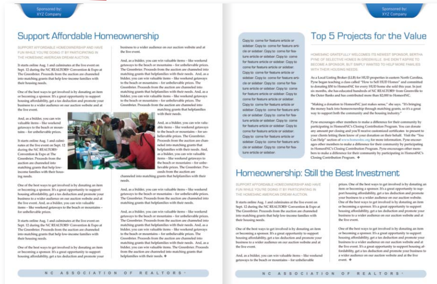
*Sample of 4-page publication placed for promotional purposes and content included for position only.